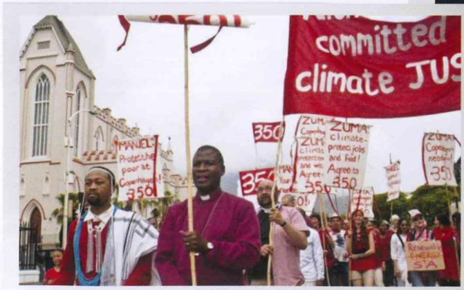
ANGLICAN CHURCH OF SOUTHERN AFRICA